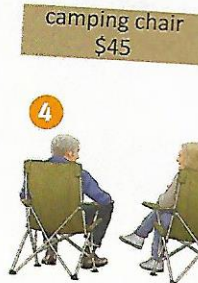
4 camping chair $45