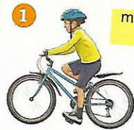
1 mountain bike $1,500