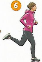
6 rain jacket $87