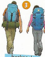
3 backpack $99